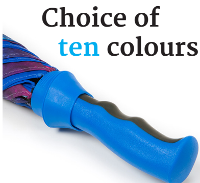
Standard plastic pistol grip handle with black finger grips

ProBrella FG Max Vented umbrellas are available with a black pole only but with a choice of ten colours for handles and ferrules.